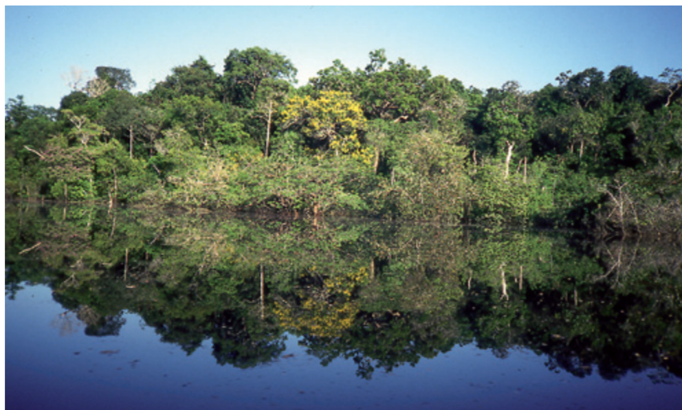
Primeval forest of the Pantanal, a tropical wetland in South America.

The probability that the investigation of a random sample of plant materials, from the rainforest or other botanical sources, will lead to really interesting drugs is relatively small. It is therefore necessary to scrutinise