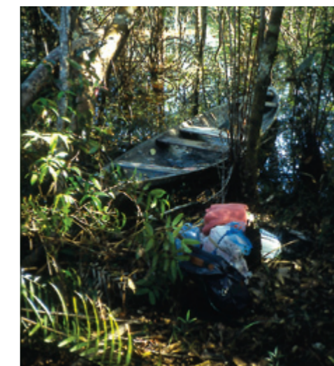
Expedition to the primeval forest on the banks of the Amazon.

extreme habitats. If it is impossible to find the same substance in a cultivatable plant, chemical synthesis de novo was usually the first alternative to be considered. Nowadays, a combination of chemical and enzymatic syntheses promises more rapid success. In the more distant future, the methods of metabolic engineering may provide tailor-made drugs of plant origin by growing genetically modified plants or by using cultures of microorganisms.