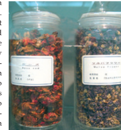
Dried flowers in the laboratory.

defence and communication systems that are based, as for other sessile organisms, on chemical compounds – the secondary metabolites. The secondary metabolites have been optimised by evolution so that they – to stay with the example of defence mechanisms – induce a reaction in the animal to be repelled. In the simplest case, this consists of the recognition of a bitter taste; a much more devastating reaction may consist of effects on the nervous system or the circulation. Such effects are often the basis of many poisons whose consumption may be fatal. The biological activity , i.e. the induction of clearly defined reactions in an animal, also applies to humans. This is the reason that so many plant substances or derivatives thereof are successfully employed in medicine, when appropriately diluted.