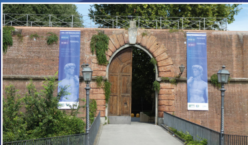
The entrance to the historic Fortezza da Basso, venue for the 2019 European Congress in Chemical Engineering'

EFCE welcomed the strong participation and international presence, the spread and quality of the scientific content and the engagement of the delegates with the programme. We now look forward to the 2021 event in Berlin!