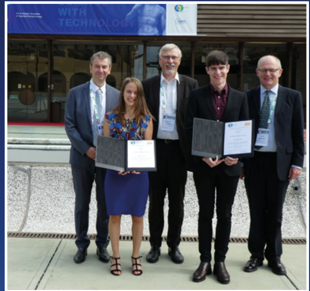
Student Mobility Award presentation 2019