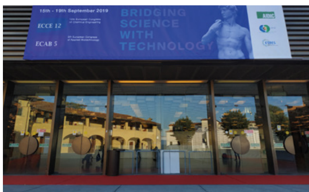
The Spadolini Entrance welcoming visitors to ECCE12&ECAB5