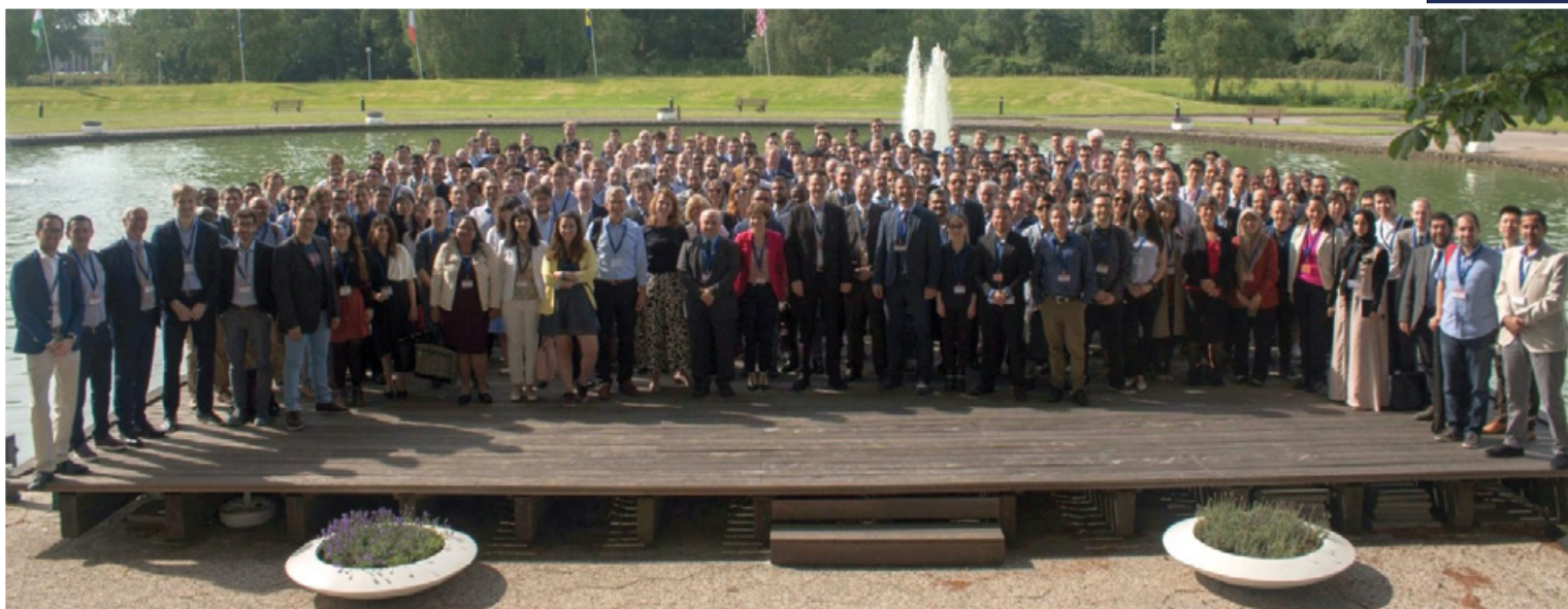
Attendees at the ESCAPE 29 conference in 2019