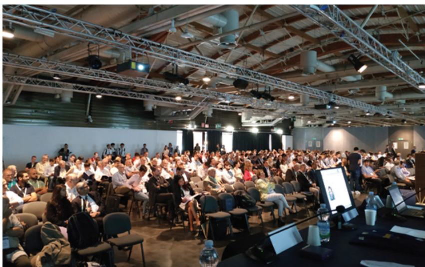
1300 participants joined us for ECCE&ECAB in Florence

After strengthening links to SUSCHEM and A.SPIRE, two institutions much involved in the development of R&D funding programmes and advocacy for science, EFCE in 2018 formalised its collaboration with the European Society of Biochemical Engineering Sciences (ESBES). The organisations had for a number of years joined up their flagship events, the European Congress of Chemical Engineering and the European Congress of Applied Biotechnology, and they continued their partnership in 2019 with the joined 12th European Congress of Chemical Engineering and 5th European Congress of Applied Biotechnology and the selection of the 2023 host of the conference series.